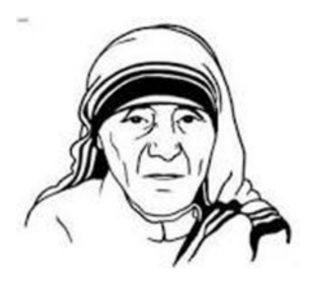
eating. This helped her to achieve a great rapport with the masses.

No one wants the dying, the diseased and the crippled people. But the homes which she has established welcome such unwanted people. Her service began when she saw a woman lying in front of the hospital half - eaten by rates and worms. She looked after her till the old woman died.